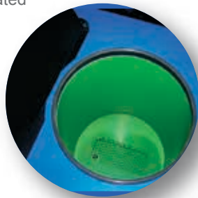
Teflon® coated tanks

Solid-state controls, precise RTD temperature sensors, and thermostatic temperature control optimize system performance