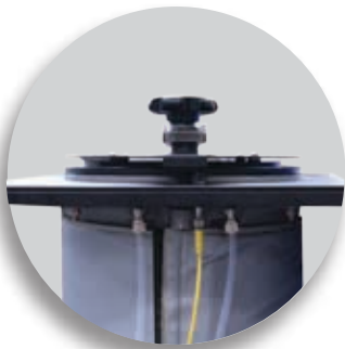
Air-tight tank opening and blowing system.