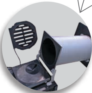
Faster and safer maintenance and cleaning operations thanks to its tiltable tank and removable melting grid.