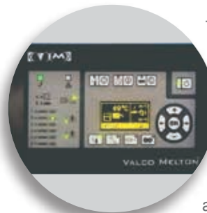
The integrated grammage control, accessible through a multi-function controller, simplifies operator's programming tasks to eliminate product loss and downtime associated with incorrect coat weight adjustments.