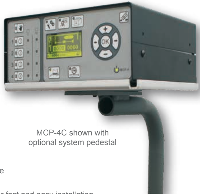
MCP-4C shown with optional system pedestal