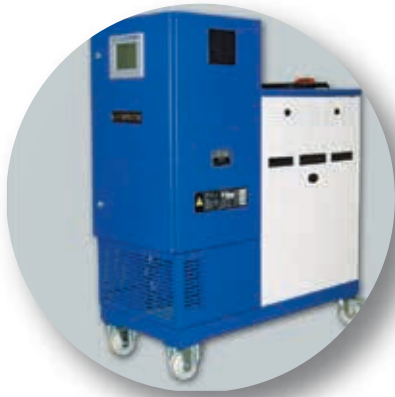
Caster available for easy mobility