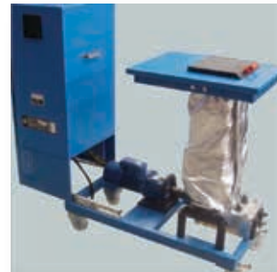
Easy access for maintenance