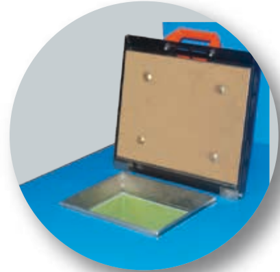
Large tank opening with easy access for filling and maintenance