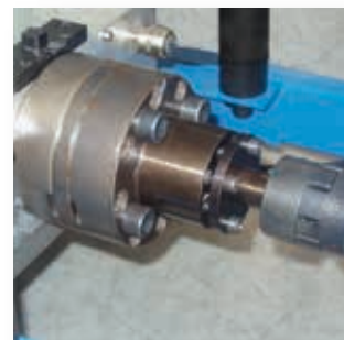
HS compatible pump to ensure stability in performance