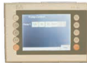
Touchscreen panel for easy operation control