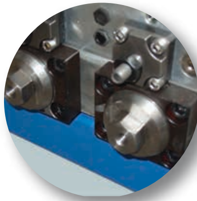
Compatible filter with pressure discharge valve