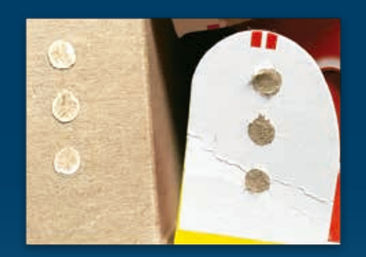
VALCO MELTON'S ECOSTITCH SOLUTION