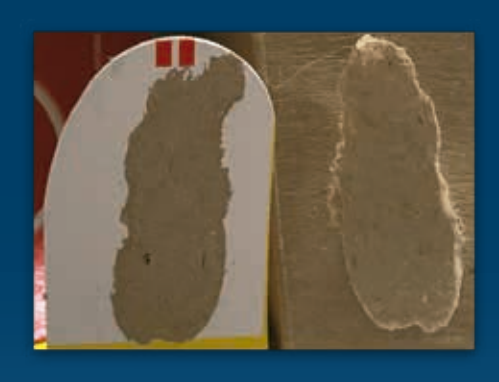
TRADITIONAL PNEUMATIC SYSTEM