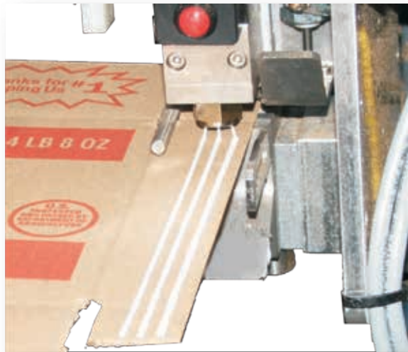
Valco Melton's Non-Contact Flexoseal® BoardRunner with CGS-40 Glue Inspection