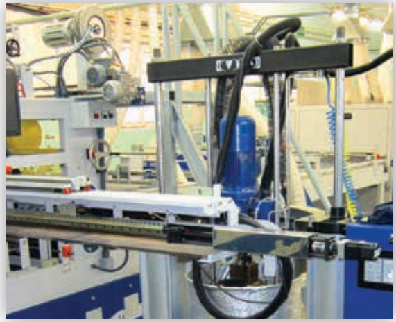
Guarantee consistent coat weight with motorized width regulation linked to grammage control.

The standard FlexWrapp features an easy to use width regulation system—bilateral, independent, and with just one operational side. Motorized width regulation linked to grammage control is available as an option.