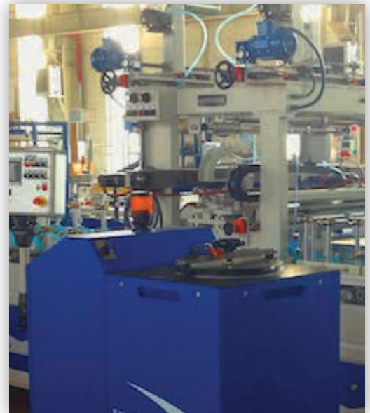
Panel wrapping solutions for the woodworking, PVC and aluminum industries.