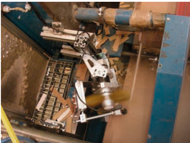
Trim Removal System installed on a Flexo-Folder-Gluer