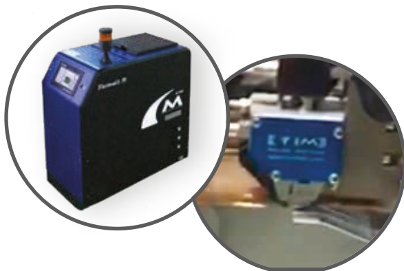
Hot melt melter and applicator

① An accurate hot melt stripe is applied onto the substrate.