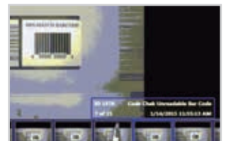
Error Detected: Unreadable Code