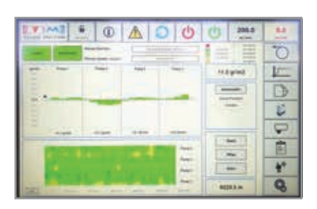
Weight-Inspekt grammage control working in close-loop